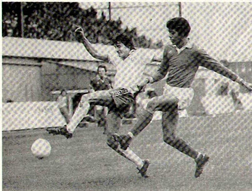
Swindon's Chris Kamara (right) in action against Gillingham at the County Ground, when the Town won 3-2.