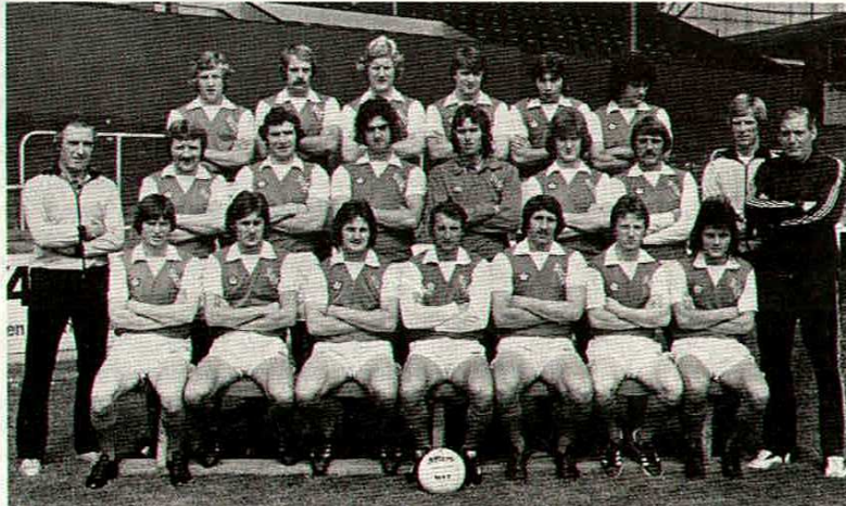
ROTHERHAM UNITED F.C. (From Left to Right)

League record: Leicester 56(5) aps, 5 gls; Southend (loan) 1 ap; Mansfield 117(3) aps., 6 gls; Rotherham 5 aps.